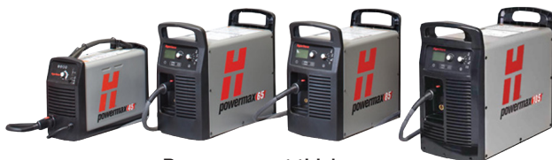
Powermax cut thicknesses 45xp (220V 12mm)/ 65 (12mm)/ 85 (16mm)/ 105 (22mm)