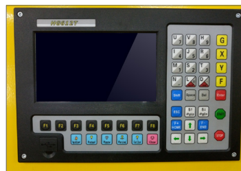
7" display colourful interfaces 44 shapes in controller library