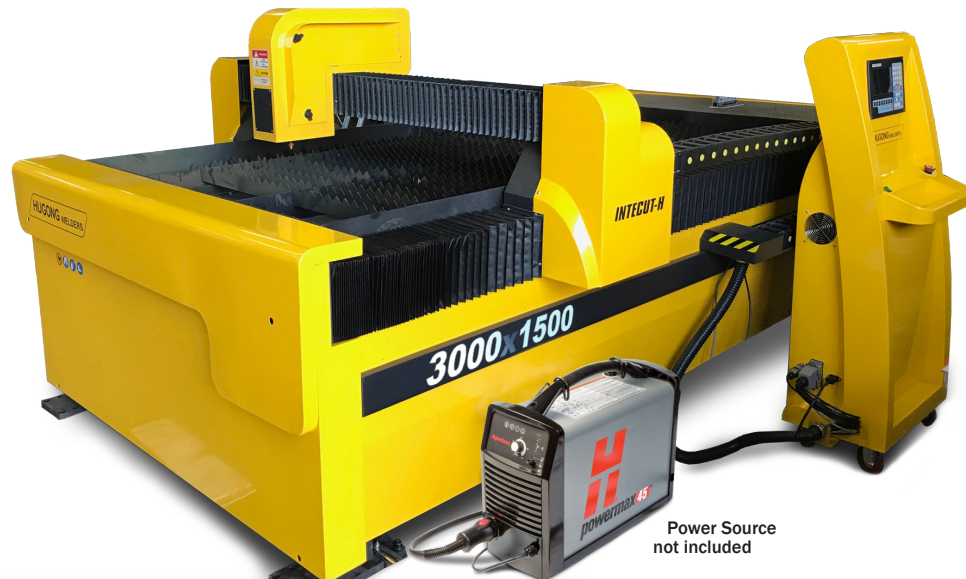
Power Source not included